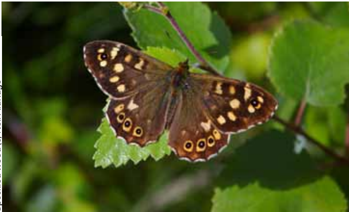
Speckled wood

Where is it? Great Doward in the S of the county. Grid ref: SO 553 158