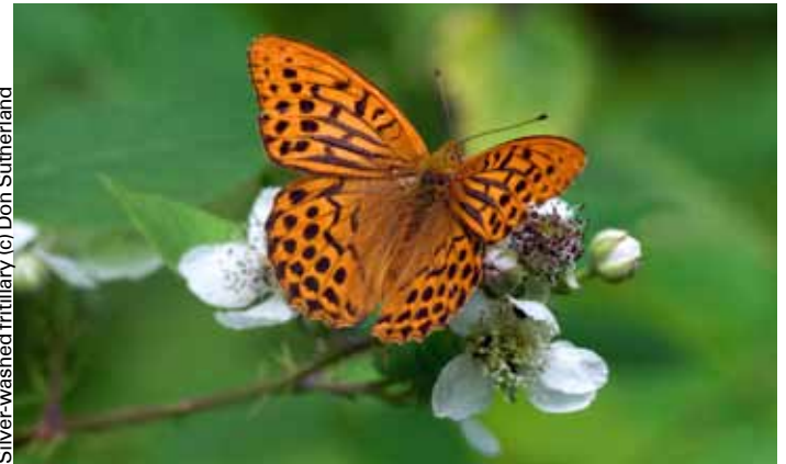
Silver-washed fritillary