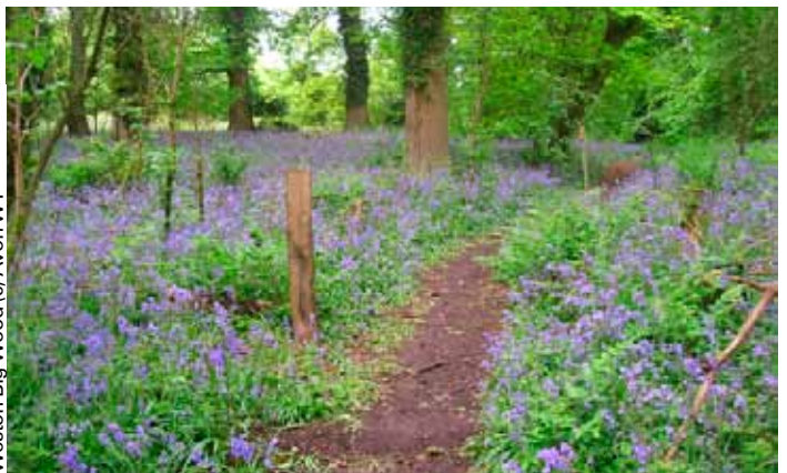
Weston Big Wood

Where is it? From the village of Grafton Flyford the wood is about 1km along a footpath through fields. Grid ref: SO 971 558