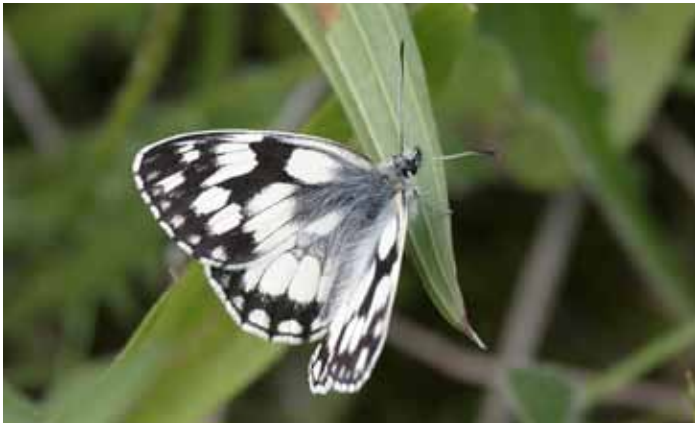
Marbled white

Where is it? 15 miles NW of Norwich, signed R off A1067 Fakenham road. Entrance is a mile after Foxley village. Grid ref: TG 049 229