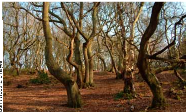
Burnt Wood

Where is it? Entrance via Cornforth Close in Stockton on Tees. Grid ref: NZ 420 205