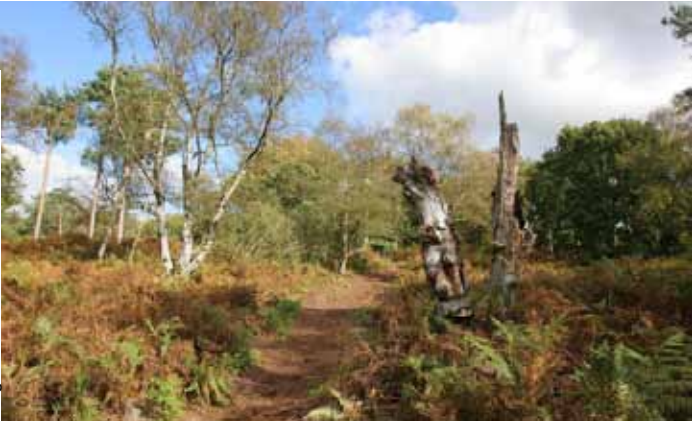
Kings Wood

Where is it? Between Eaton and Upton. Grid ref: SK 727 771