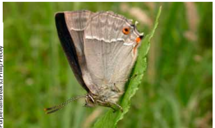
Purple hairstreak

Where is it? Felsham Road, Bradfield St George. Grid ref: TL 935 580