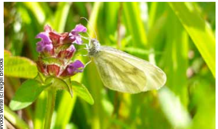
Wood white