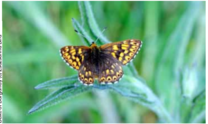
Duke of Burgundy

Where is it? On the River Ribble E of Preston. Grid ref: SD 579 314