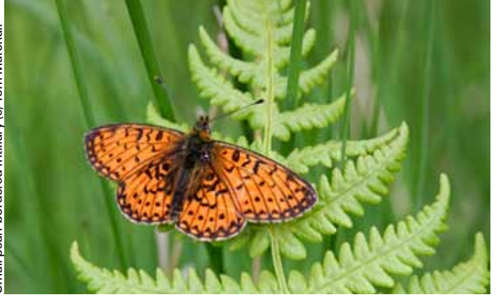
Small pearl-bordered fritillary (c) Tom Marshall

Where is it? 5 miles S of Bicester. Grid ref: SP 602 146