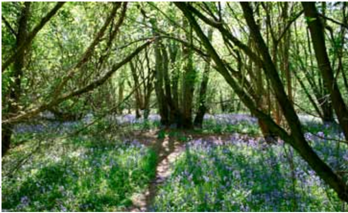
Foxley Wood