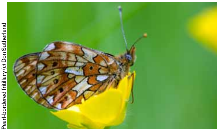
Pearl-bordered fritillary

Where is it? S Cumbria, off A590 from the M6. Grid ref: SD 435 882