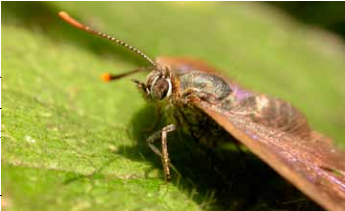
Purple hairstreak

Where is it? N of Basingstoke, Hampshire. Grid ref: SU 616 608