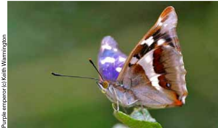
Purple emperor