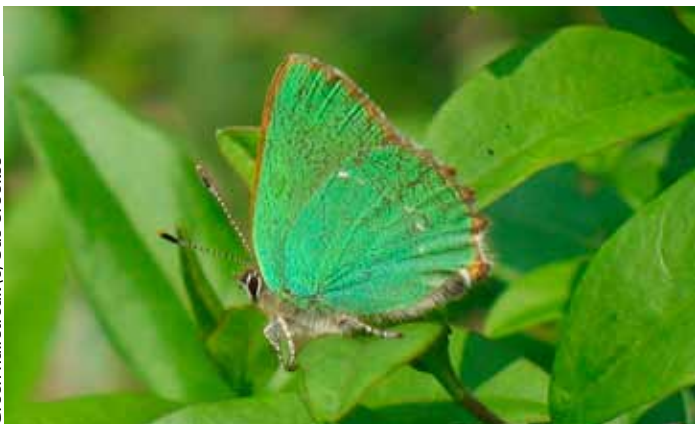
Green hairstreak

Where is it? 0.5 miles E of Chopwell. Grid ref: NZ 113 570