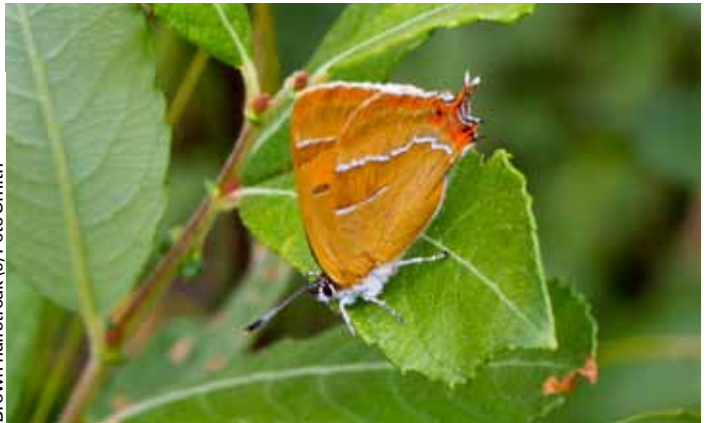
Brown hairstreak

Where is it? 1 miles N of Carnforth. Grid ref: SD 493 728