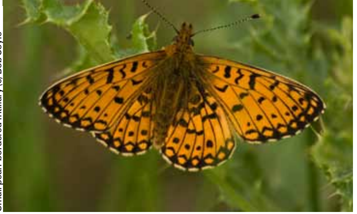
Small pearl-bordered fritillary

Where is it? Lies on the south shore of Loch Creran. Grid ref: NM 907 418