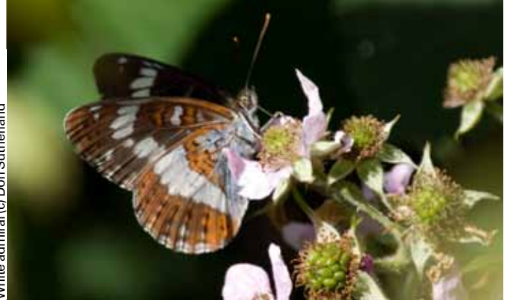
White admiral

Where is it? 1 mile W of the village of Little Smeaton by public footpath, or car park down unmarked lane off New Road. Grid ref: SE 513 174