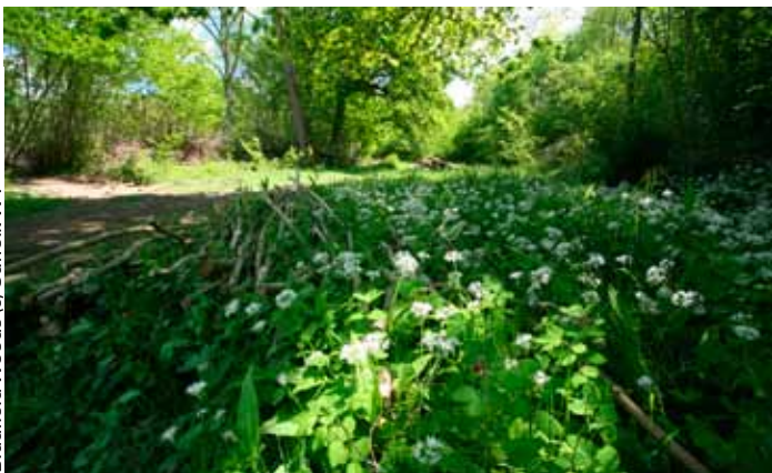
Bradfield Woods

Where is it? On the B1418 road 400m south of the Brewer's Arms pub in Bicknacre. Grid ref: TL 790 017