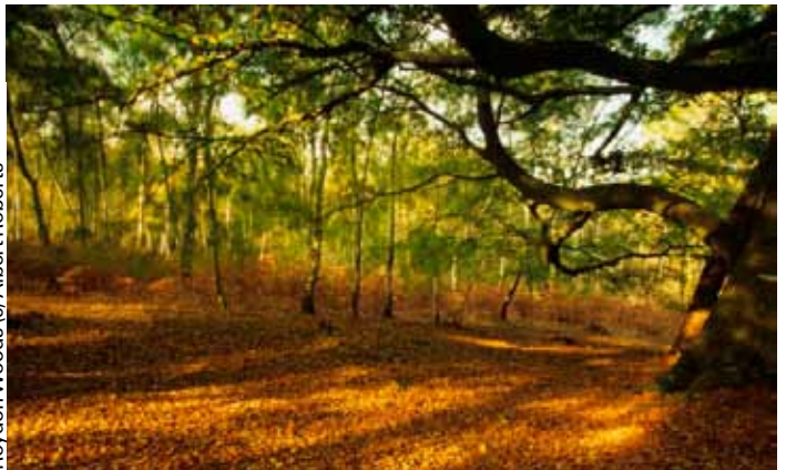
Roydon Woods

Where is it? Between Sapperton and Oakridge. Grid ref: SO 945 035