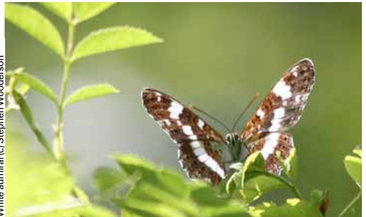
White admiral

Where is it? 1 mile SE of Wells city centre. Grid ref: ST 565 456