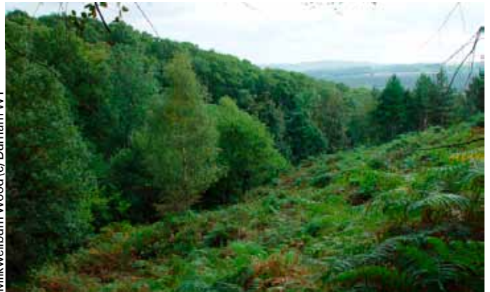
Milkwellburn Wood

Where is it? 2 miles S of Camborne. Grid ref: SW 640 376