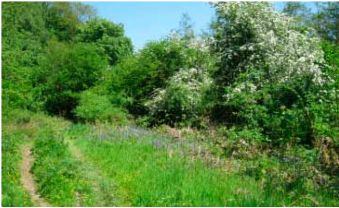
Boilton Wood