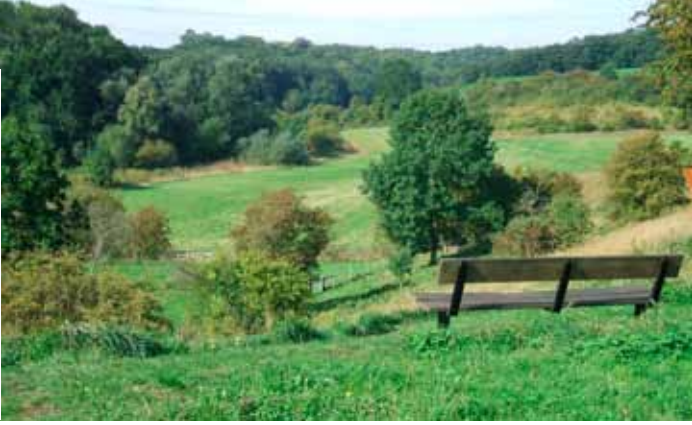
Brockdale