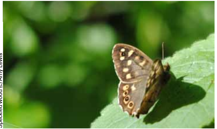
Speckled wood

Where is it? In the Glenarm estate, off the B97 Ballymena Road. Grid ref: D 304 111