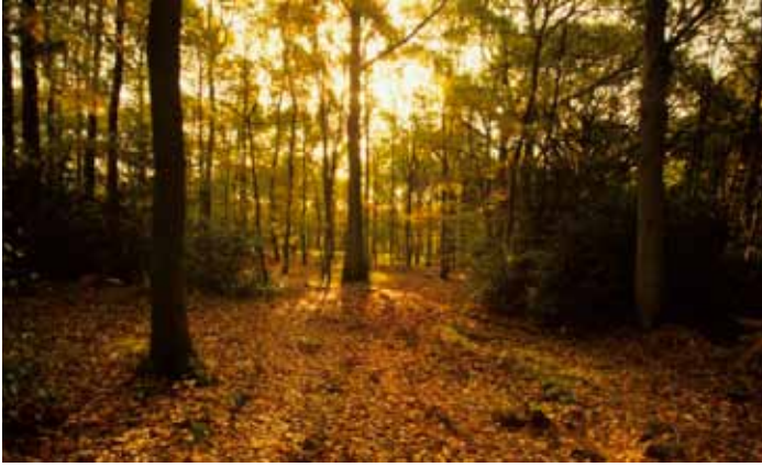
Pamber Forest