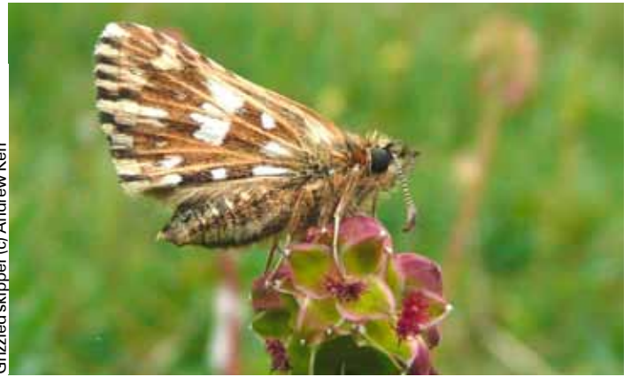
Grizzled skipper

Where is it? Upper Swansea Valley. Entrance by Hendreladus (SA9 1SE) past youth and community centre. Grid ref: SN 796 108