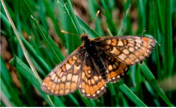
Marsh fritillary