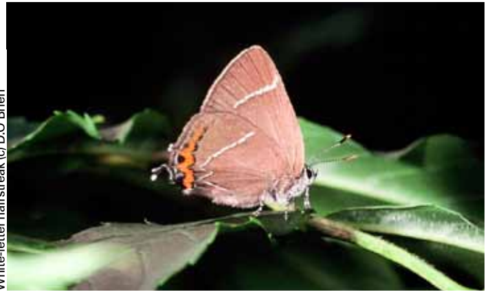
White-letter hairstreak

Where is it? S of Hexham, just N of Slaley village. Grid ref: NY 977 587