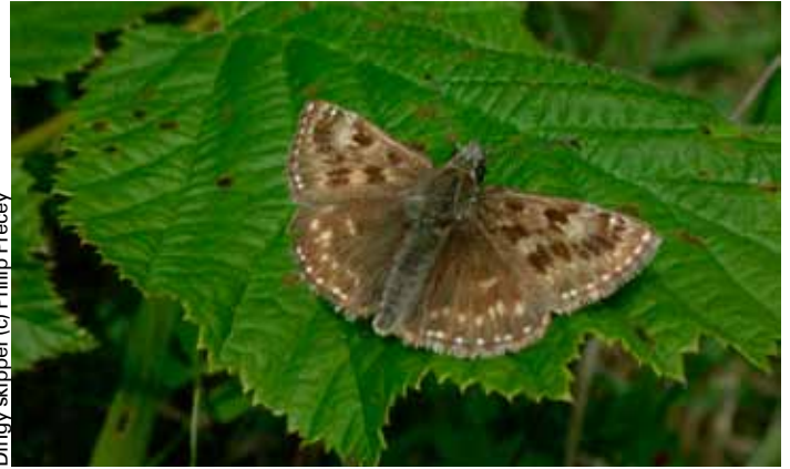
Dingy skipper

Where is it? 5 miles from Leighton Buzzard. Grid ref: SP 920 294