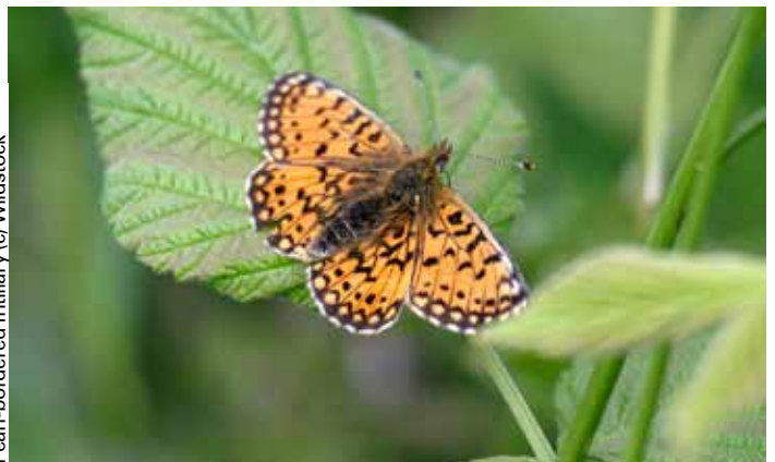
Pearl-bordered fritillary

Where is it? 3 miles north of Rhayader. Grid ref: SN 964 717