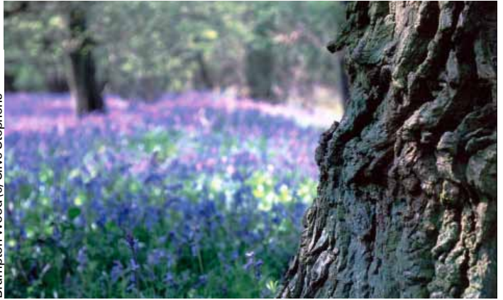
Brampton Wood

Where is it? Off the A57 between Sheffield and Glossop. Grid ref: SK 205 867