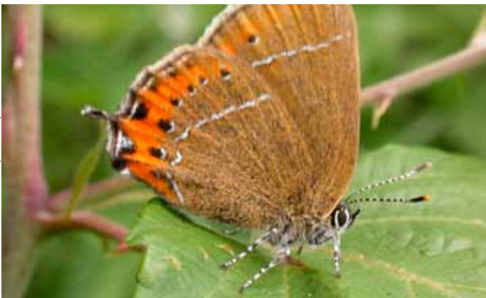
Black hairstreak

Where is it? Greater London. Entrance on Crescent Wood Road (opposite Countisbury House towerblock). Grid ref: TQ 344 725