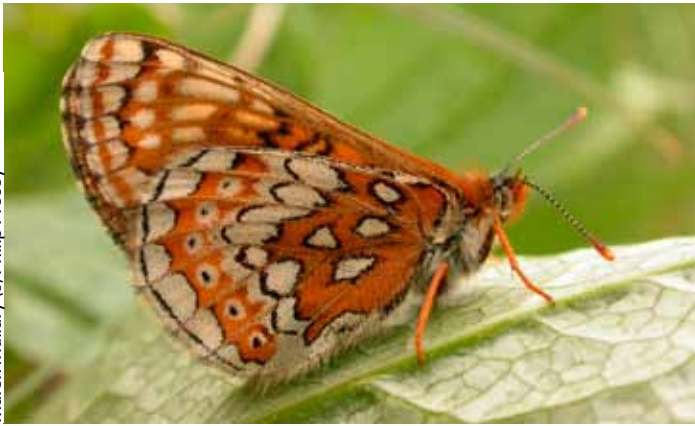
Marsh fritillary